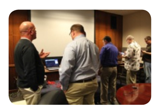
Cisco demonstrates its mobility solutions.

For more information about the 2012 Technology Summit, along with video highlights, WebEx recordings, and vendor presentations, visit the ETADS Web site at <a href="https://etads.nasa.gov">https://etads.nasa.gov</a>.