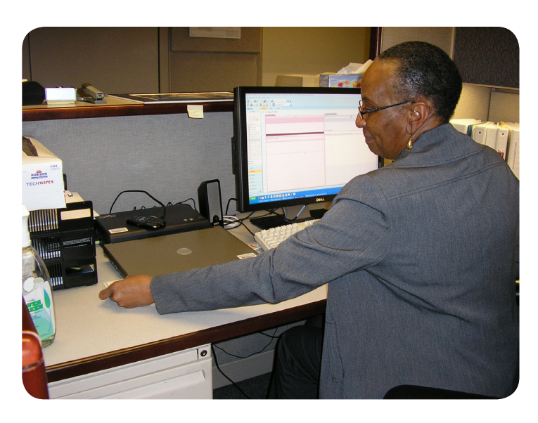
Examples of Sun Product Suite capabilities currently utilized at NASA.

Look for NEACC's "About Us" on <a href="https://bReady.nasa.gov">https://bReady.nasa.gov</a> in the months to come for more details on this new NASA project. For more information about ICAM services, check out <a href="https://icam.nasa.gov">https://icam.nasa.gov</a>. *