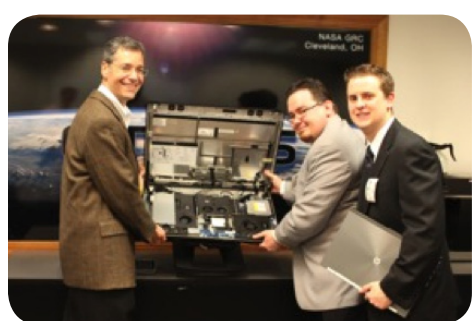
Intel briefing at ETADS.