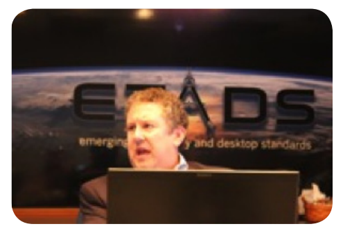
Hewlett-Packard presents the Z1 "All-in-One" Workstation.