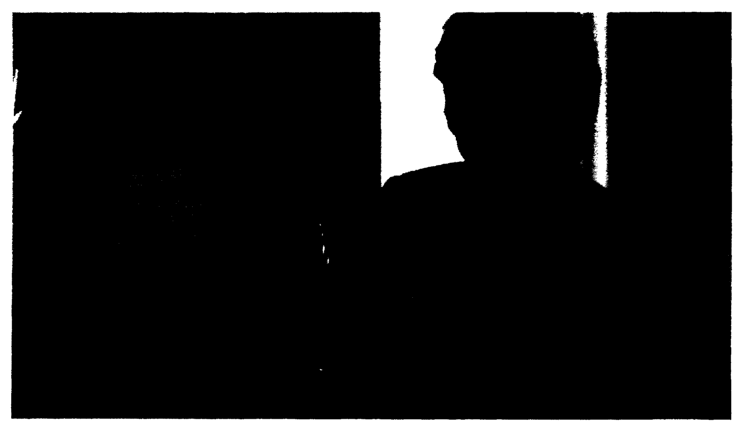
Democratic presidential nominee Hillary Clinton in a file photo

"The DNC must remain neutral in the presidential primary process, and there shouldn't even be a perception that the DNC is interfering in that process," Hinojosa said.